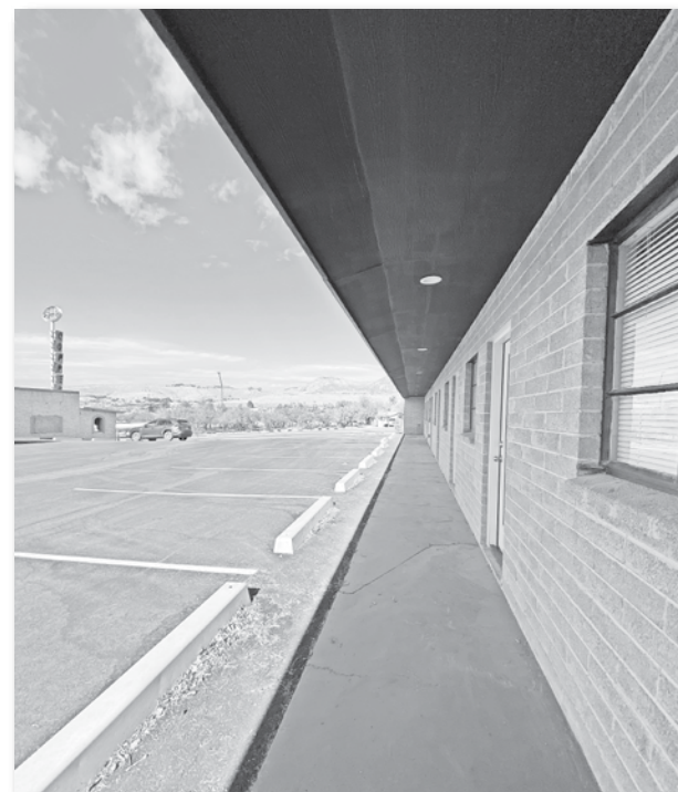
The Copper Bottom Apartments are providing some much needed housing in Superior.

The developers plan to remodel and repair the old Ritchies Bar into an event venue and they hope to begin construction on that in early 2022. The venue will be available for parties and meetings.