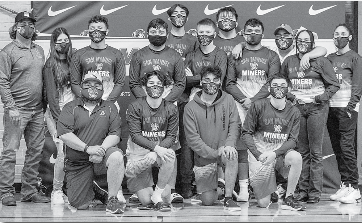
San Manuel High School Wrestling Team 2021