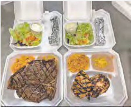
Every other weekend, La Casita offers a cooked to order steak or chicken dinner.

APACHESKYCASINO.COM | 888-7-APACHE Just South of Mile Marker 127 on Highway 77, 40 minutes north of the Biosphere.