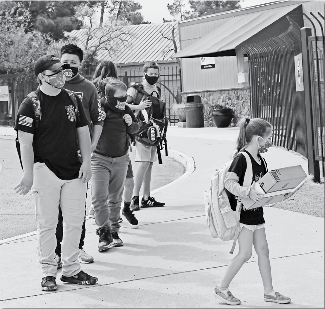
Students wait in line to have their temperatures checked prior to entering school property. School officials will continue the practice once school has started full-time and in-person next week.