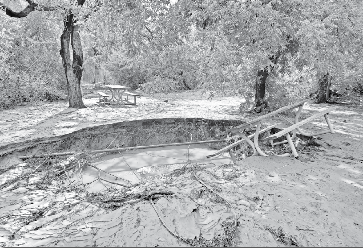
The picnic area at the Boyce Thompson Arboretum was damaged after the area was flooded during a monsoon.

event goers and visitors to Superior for shelter and dry cover. More storms are predicted throughout the week. Residents are asked to please not go around high water crossing barriers. Sand bags are available at Town Hall for those that need them. Crews are working as quickly as possible to clear the debris from the streets. The Arboretum is also looking for volunteers to help with clean up and debris removals. You can contact them directly at 520-689-2723 for more information on volunteering for the clean up efforts at the garden.