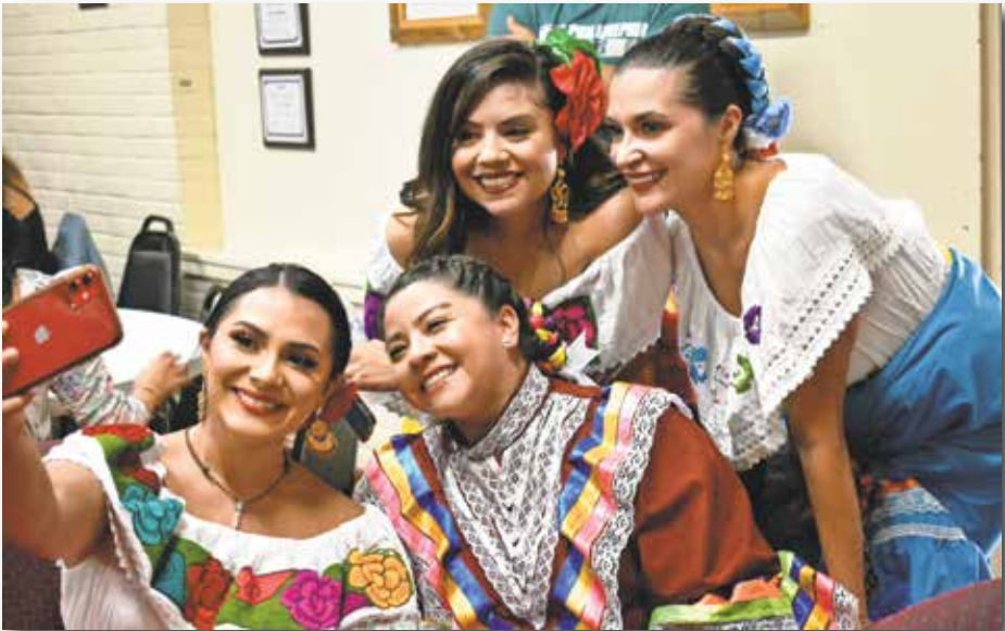
Taking that all important selfie!