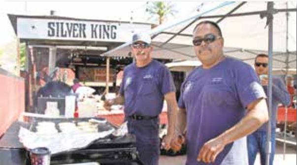
Serving up some yummy food at the pancake breakfast.