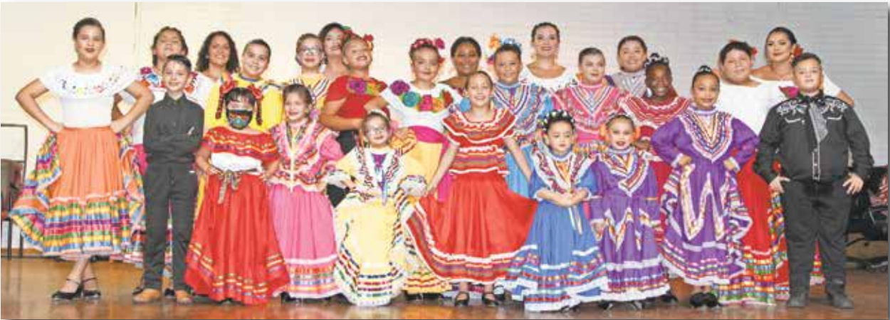
Superior Dance Company.