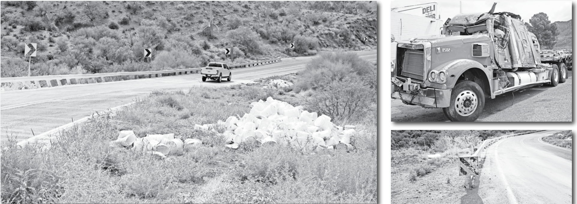
An overnight accident on Highway 177 at milepost 159 between Kearny and Superior has left the driver injured and blocked the roadway from 9 p.m. Wednesday, Aug. 11, until after 1 a.m. Thursday morning, Aug. 12. According to the Arizona Department of Public Safety, the one-vehicle injury accident involved a semi-truck hauling a load of five-gallon buckets of paint. Paint buckets were dumped off the side of the roadway and paint splattered the road and guardrails near the accident site. The extent of the driver's injuries were unknown. James Carnes | Copper Area News