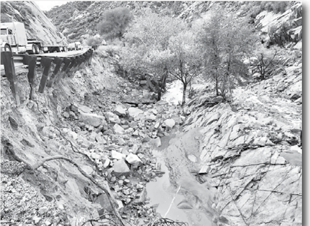
Flood damage to U.S. 60 between Superior and Miami following recent monsoon rains.